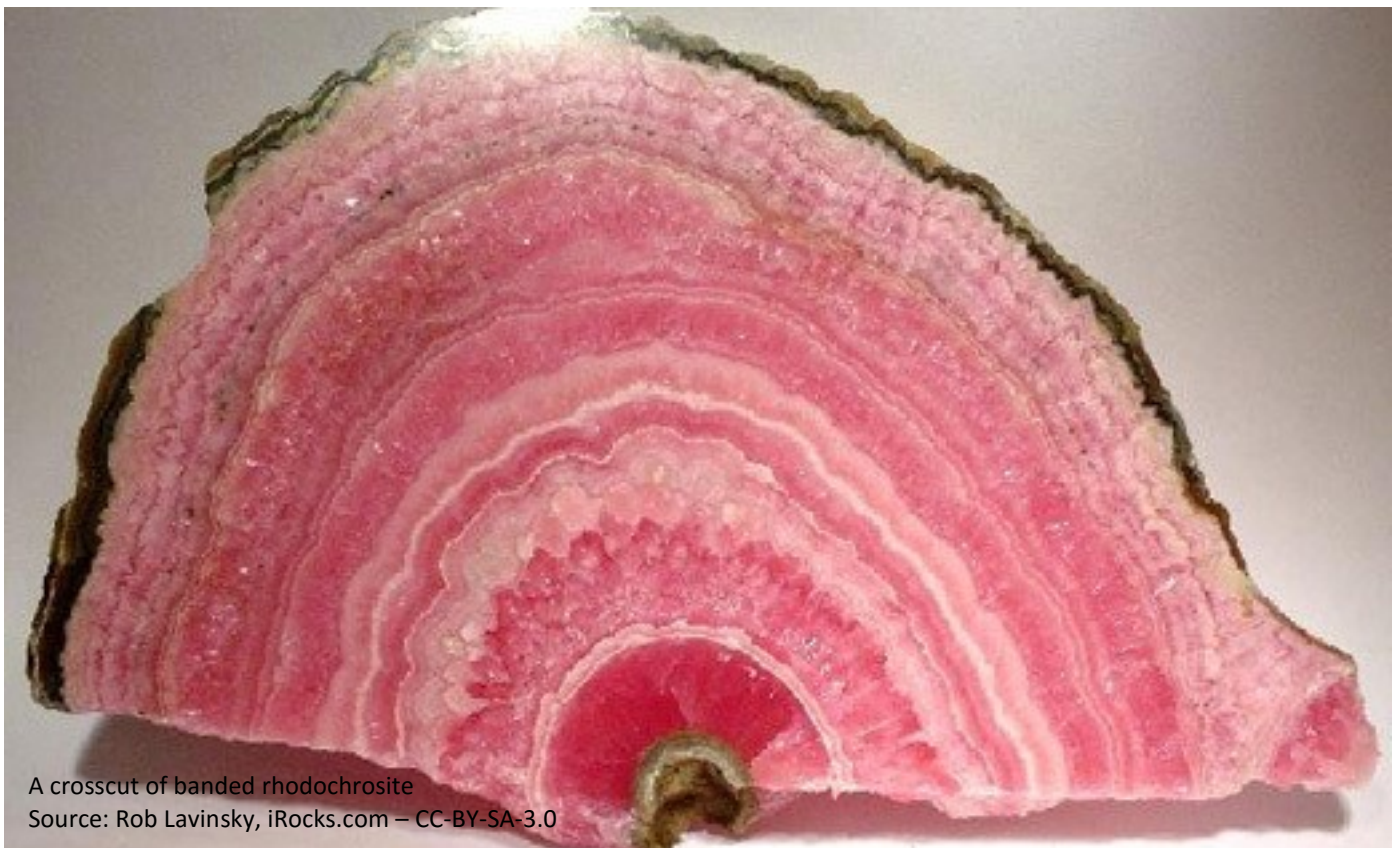
A crosscut of banded rhodochrosite